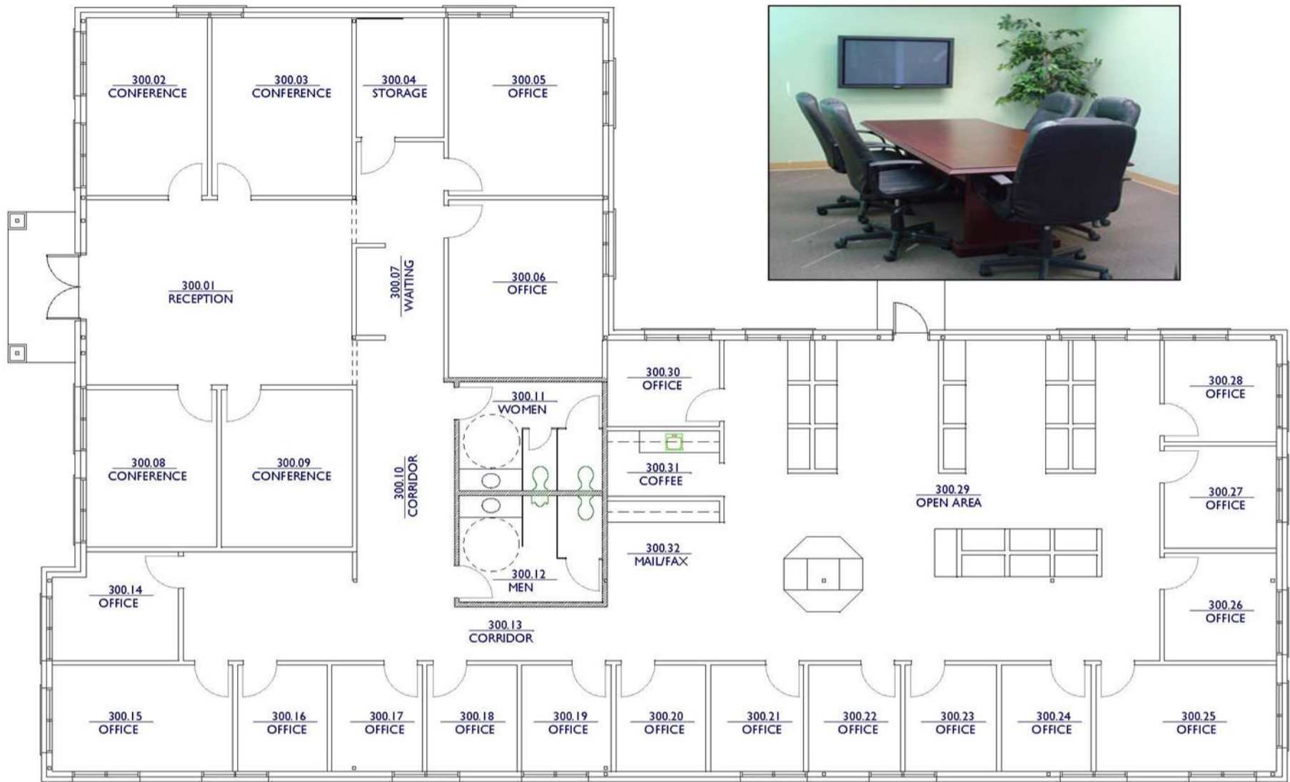
○ Partition Plan